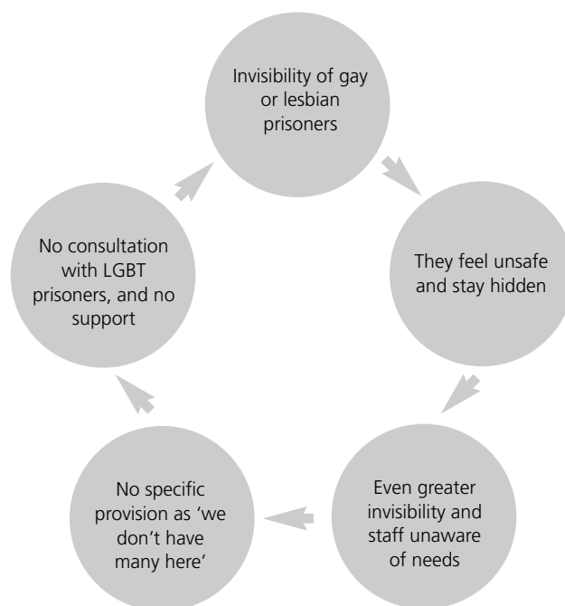
Figure 1: the cycle of invisibility.

The invisibility of gay and lesbian prisoners is compounded by the heterosexist tendency of some staff to perceive being gay, rather than homophobia, as the problem. During a recent inspection we talked with an Iranian gay man who was facing deportation at the end of his sentence. He was fearful of being killed on his return to Iran and he had asked staff for help in contacting organisations that had experience of supporting Iranian gay men. A letter the diversity senior officer had written to him concluded: 'If I can be of any further help to you with problems arising from your homosexuality please do not hesitate to ask.' He told us how upset he was about that phrase, which expressed the officer's failure to understand that his problem was